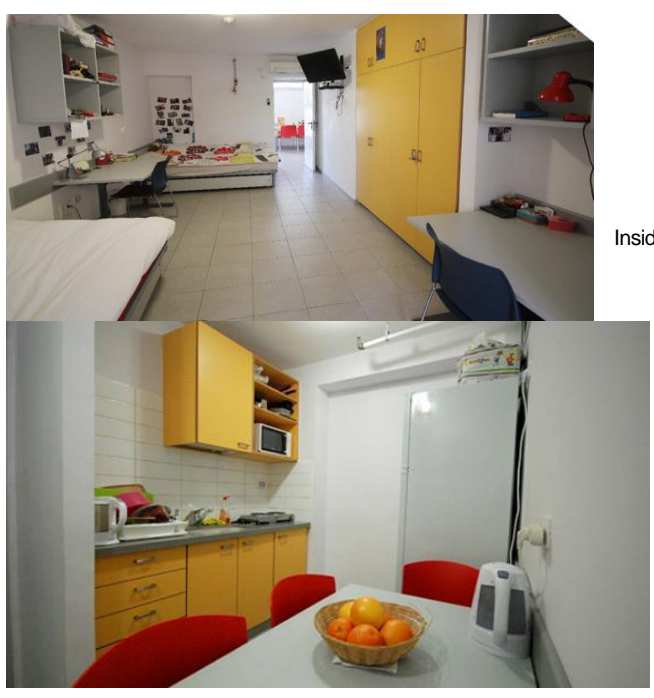
Inside an Einstein dorm room

Prices are 600 USD per month for a shared room, utilities and municipal tax included. The shared areas will be cleaned on a weekly basis. Students who are living in the dorms are expected to sign a contract and pay in advance.