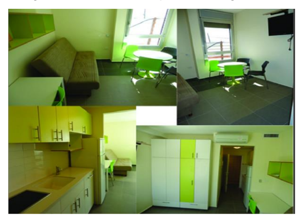
Inside the Broshim studio rooms

Fees: 800 USD per month for a studio apartment utilities and municipality tax included. Students who are living in the dorms are expected to sign a contract and pay in advance.