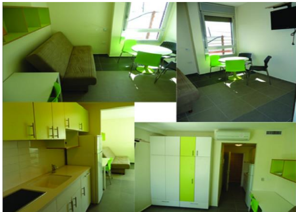
Inside the Broshim studio rooms

Fees: 800 USD per month for a studio apartment utilities and municipality tax included. Students who are living in the dorms are expected to sign a contract and pay in advance.