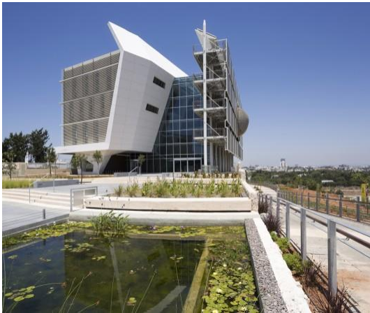
PORTER SCHOOL OF ENVIRONMENTAL STUDIES' NEW CAPSULE BUILDING

TAU’s support for sustainable projects on campus is further underscored by the Porter School of Environmental Studies’ new Capsule Building. The Capsule Building has received LEED Platinum Certification – the highest accreditation of the LEED certification system, developed by the US Green Building Council.