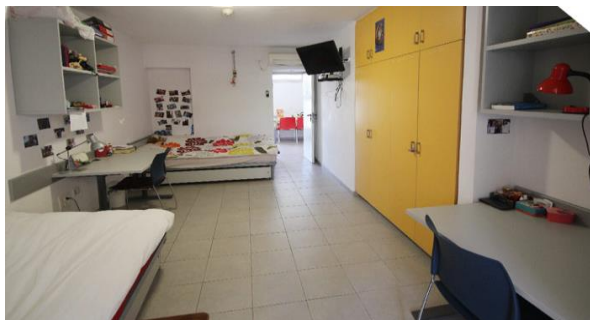
Inside an Einstein dorm room

Prices are 600 USD per month for a shared room, utilities and municipal tax included. The shared areas will be cleaned on a weekly basis. Students who are living in the dorms are expected to sign a contract and pay in advance.